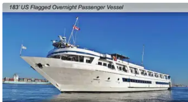
183' US Flagged Overnight Passenger Vessel